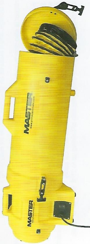
Confined Space Ventilator

Please read and keep these instructions with the Ventilator.